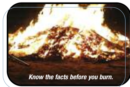
Know the facts before you burn.

Please contact the Beavercreek Police and Fire Dispatch at 937-426-1211 before starting a fire.