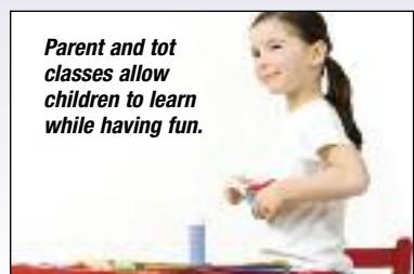
Parent and tot classes allow children to learn while having fun.