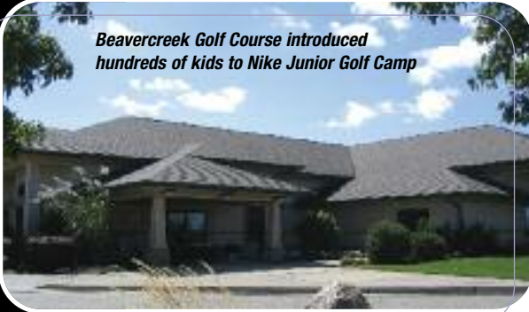
Beavercreek Golf Course introduced hundreds of kids to Nike Junior Golf Camp