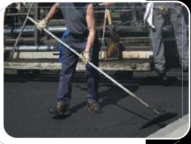
Street Division applied 6.5 tons of crack filler to repair Beavercreek City streets