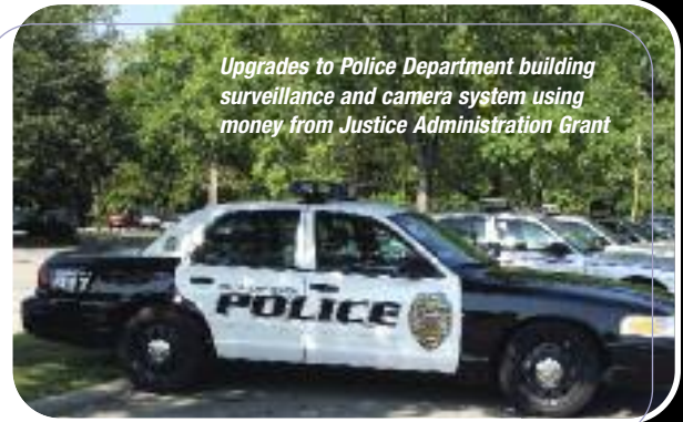
Upgrades to Police Department building surveillance and camera system using money from Justice Administration Grant